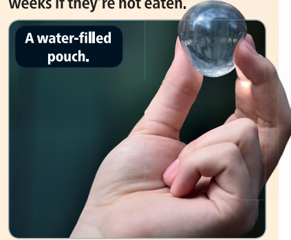
A water-filled pouch.

Edible seaweed pouches filled with an energy drink were offered to runners at the London Marathon, held on 28 April. More than 40,000 runners took part this year, and the race organisers wanted to reduce the number of plastic bottles used. The pouches, created by a London company, break down naturally within four to six weeks if they're not eaten.