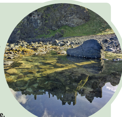
Rockpools on the nearby coast.