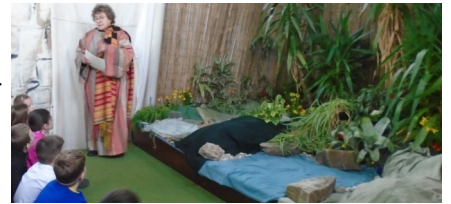
The Garden of Gethsemane